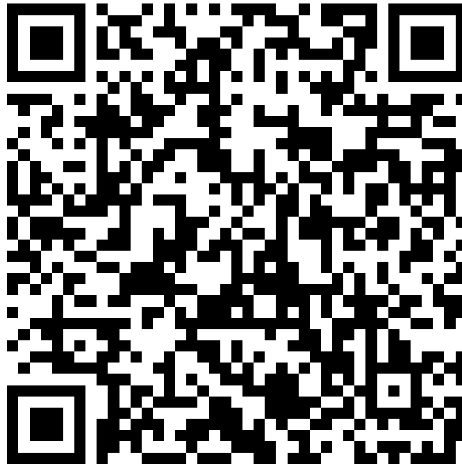
NCPS PSG QR Code